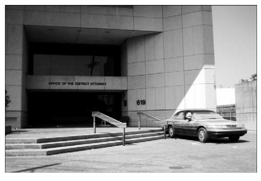
New Orleans District Attorney's Office with car

Once Katrina wiped out the material mechanisms and practices that had kept the black and poor communities of New Orleans "in their place" for centuries, it took with it these symbolic markers of racial stability and control, leaving only the racial imagination, which, for its own stability and affirmation, needs to perceive the neat separation of one group from another; to perceive a self that is "safe" from that other , or deeper, simply distinct from its Other. What happens when the stability of the distinction between one racially based identity loses the terrain upon which it knows itself, sees itself as protected from its Other, and ultimately loses the markers that separate itself identifiably from its Other?