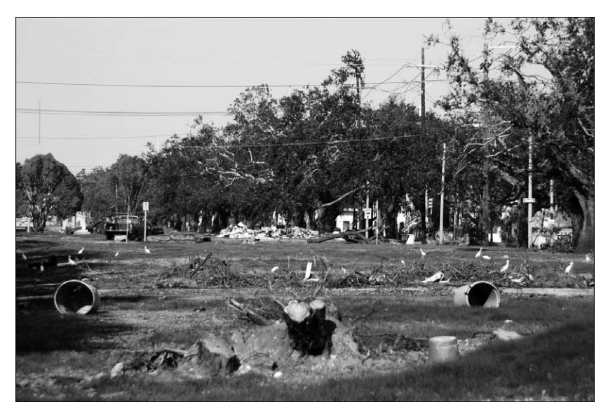
Median strip on Broad Street at Canal Street

First, Hurricane Katrina wiped out what little infrastructure actually existed to support New Orleans communities before the storm, just as ghettoization destroys infrastructure, more slowly but surely, whether by economic divestment and strangulation or by bombs and bulldozers.