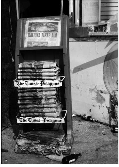
Newspaper rack and debris at corner store

This morning I woke up in a curfew, O God, I was a prisoner, too, Could not recognize the faces standing over me, They were all dressed in uniforms of brutality.